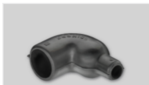
TE Part #214479-000 222A121-100/86-0