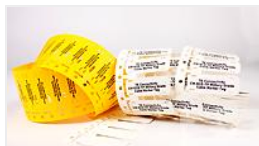
TE Part #768838-000 CM-SCE-TP-1/4-4H-9