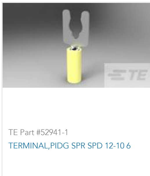
TE Part #52941-1 TERMINAL,PIDG SPR SPD 12-10 6