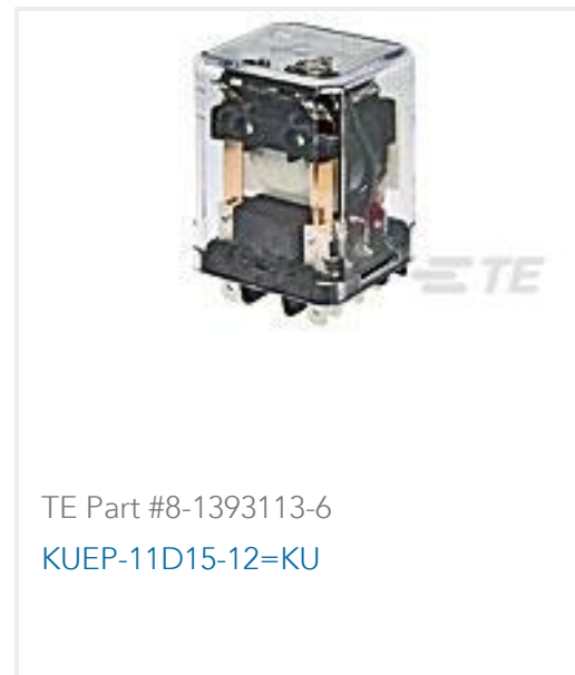
TE Part #8-1393113-6 KUEP-11D15-12=KU