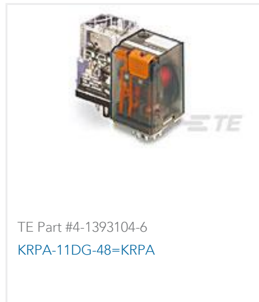
TE Part #4-1393104-6 KRPA-11DG-48=KRPA