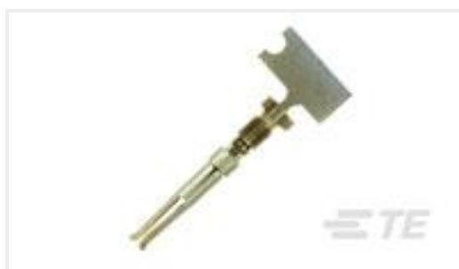
TE Part #66504-9 SOCKET CONTACT, 20 DF