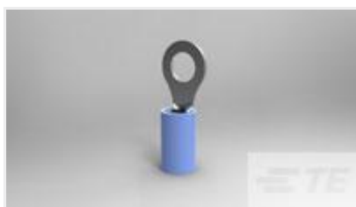
TE Part #51864-2 TERMINAL,PIDG R 16-14 10