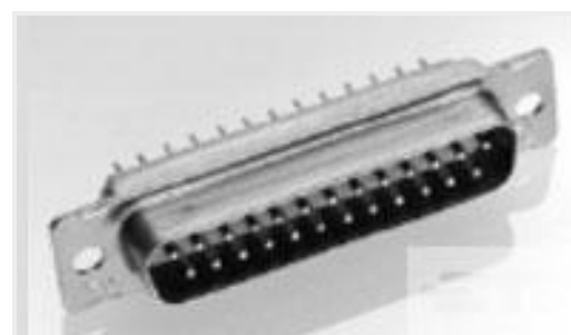
TE Part #205162-1 AMPLIMITE,ASY,PLUG,STD,109,1