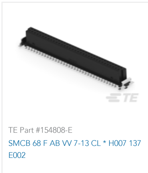
TE Part #154808-E SMCB 68 F AB VV 7-13 CL * H007 137 E002