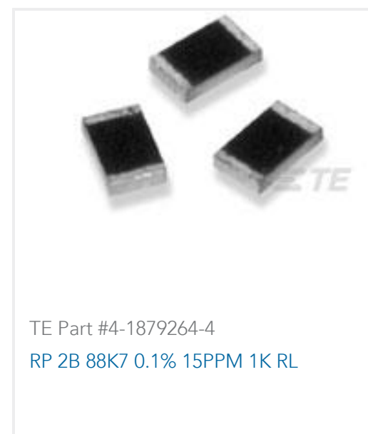
TE Part #4-1879264-4 RP 2B 88K7 0.1% 15PPM 1K RL