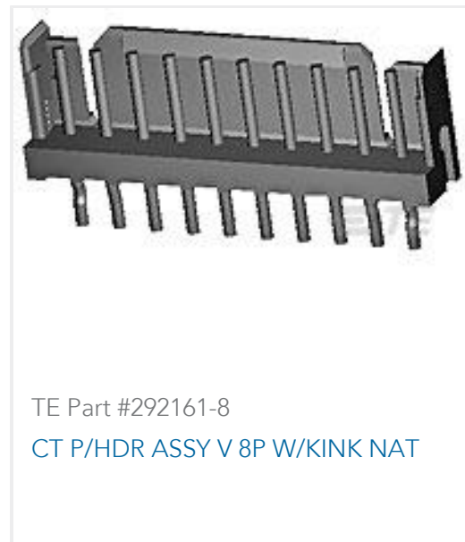
TE Part #292161-8 CT P/HDR ASSY V 8P W/KINK NAT