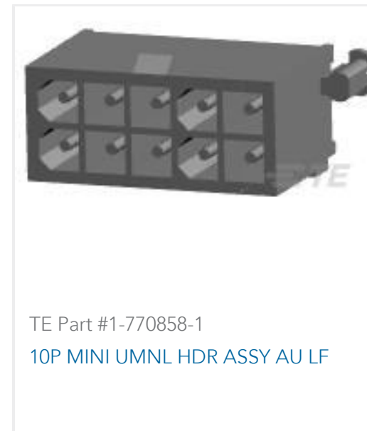
TE Part #1-770858-1 10P MINI UMNL HDR ASSY AU LF