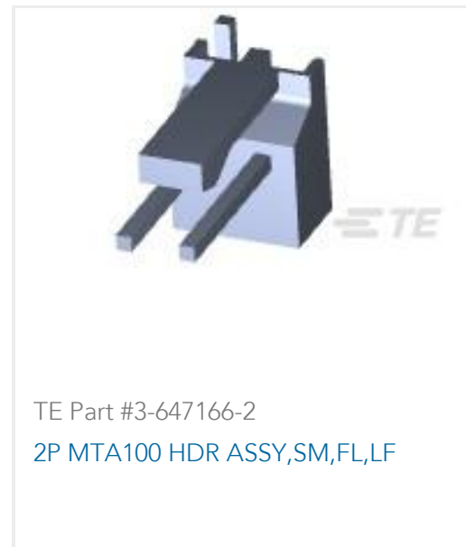
TE Part #3-647166-2 2P MTA100 HDR ASSY,SM,FL,LF