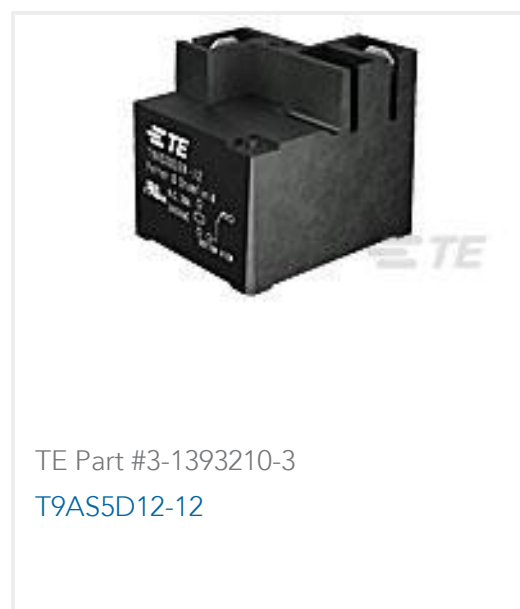
TE Part #3-1393210-3 T9AS5D12-12