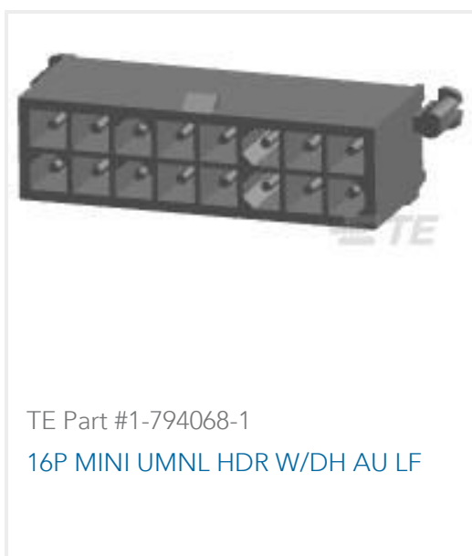
TE Part #1-794068-1 16P MINI UMNL HDR W/DH AU LF