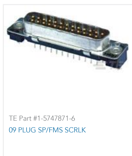
TE Part #1-5747871-6 09 PLUG SP/FMS SCRLK