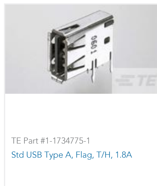
TE Part #1-1734775-1 Std USB Type A, Flag, T/H, 1.8A