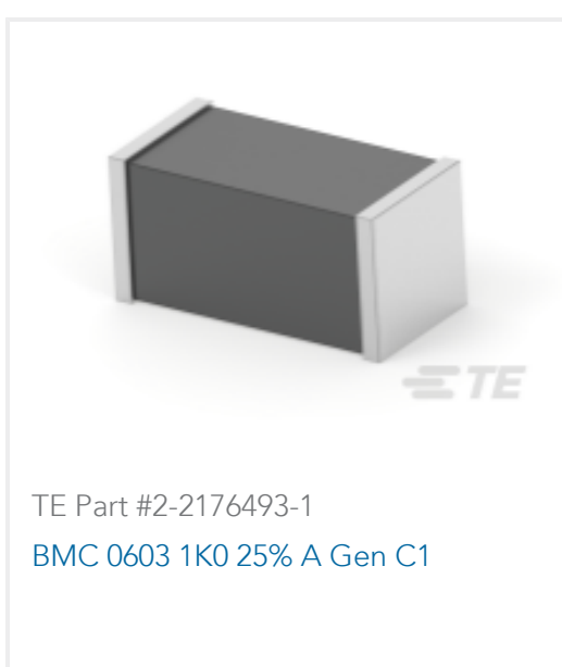
TE Part #2-2176493-1 BMC 0603 1K0 25% A Gen C1