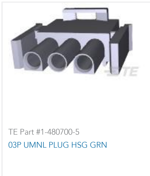
TE Part #1-480700-5 03P UMNL PLUG HSG GRN