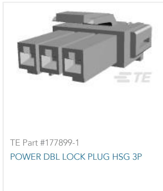
TE Part #177899-1 POWER DBL LOCK PLUG HSG 3P