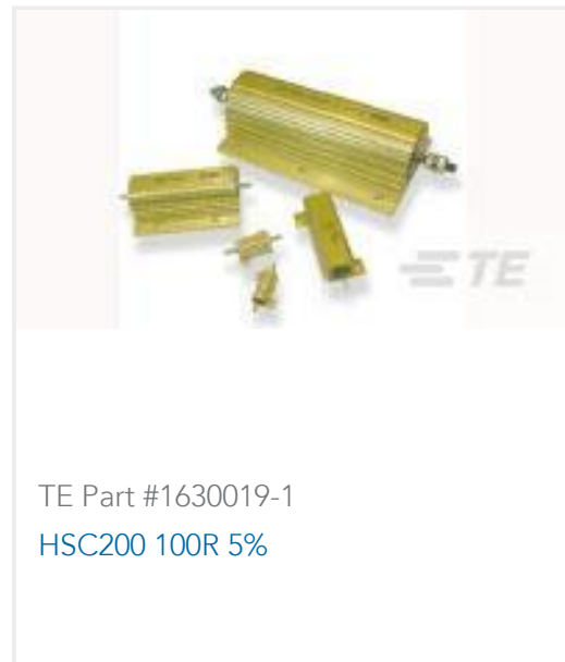
TE Part #1630019-1 HSC200 100R 5%