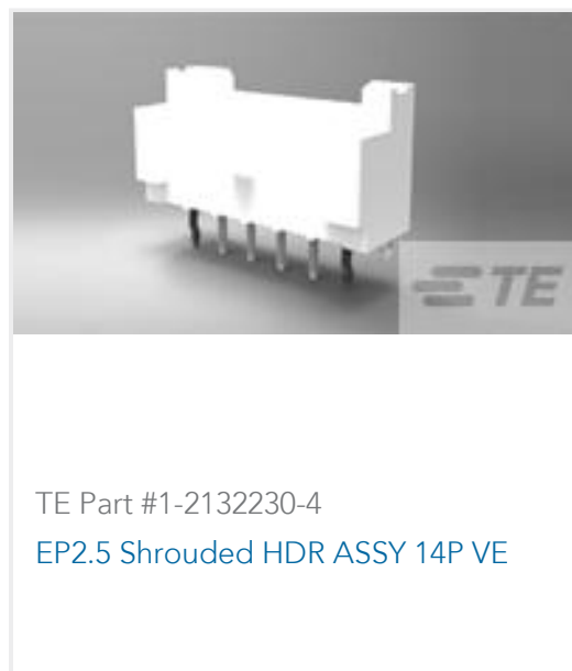
TE Part #1-2132230-4 EP2.5 Shrouded HDR ASSY 14P VE