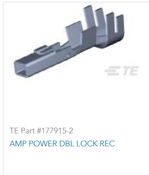
TE Part #177915-2 AMP POWER DBL LOCK REC