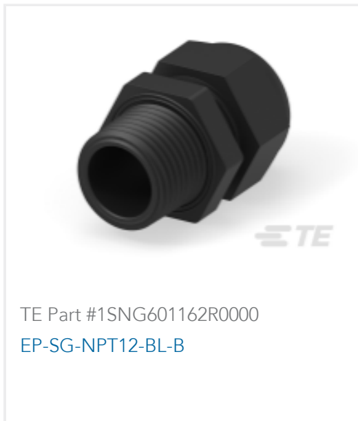
TE Part #1SNG601162R0000 EP-SG-NPT12-BL-B