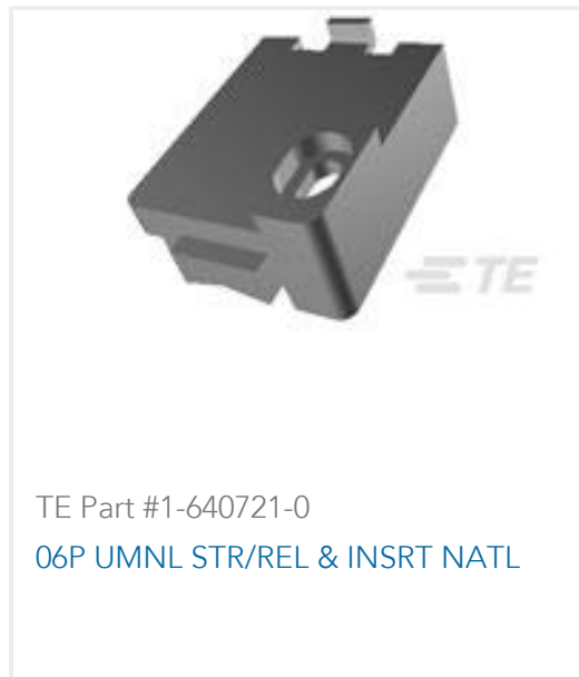
TE Part #1-640721-0 06P UMNL STR/REL & INSRT NATL