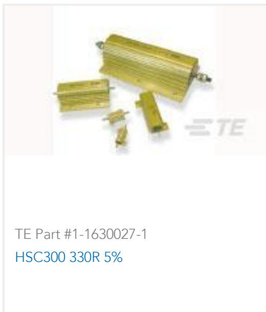
TE Part #1-1630027-1 HSC300 330R 5%