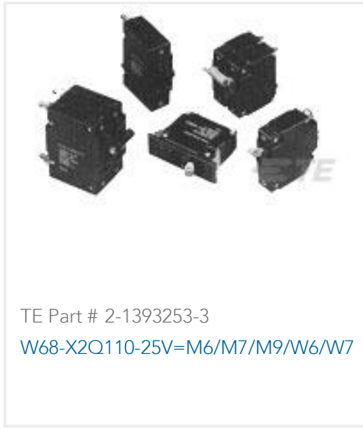
TE Part # 2-1393253-3 W68-X2Q110-25V=M6/M7/M9/W6/W7