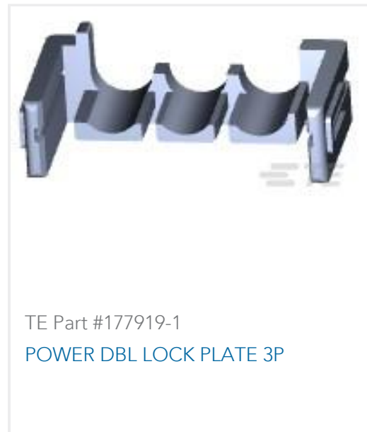
TE Part #177919-1 POWER DBL LOCK PLATE 3P