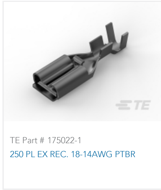
TE Part # 175022-1 250 PL EX REC. 18-14AWG PTBR