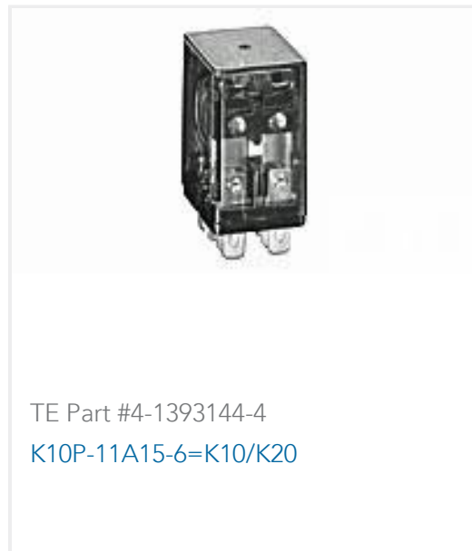
TE Part #4-1393144-4 K10P-11A15-6=K10/K20