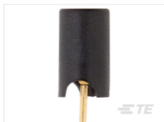
TE Part #ANT-916-JJB-HT-T Antenna Mini Straight Hi-Temp 916MHz THM