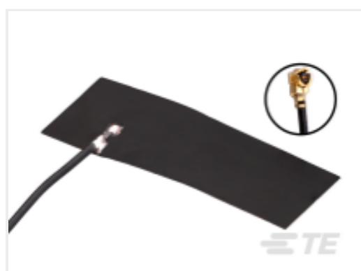
TE Part #L9000128-01 Antenna FPC 868/915MHz 1.13 100 UFL