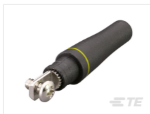
TE Part #ANT-916-PW-LP Antenna 1/4 Wave 916MHz Screw #6