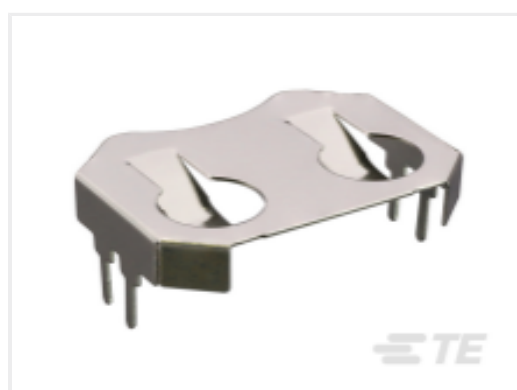
TE Part #BAT-HLD-001-THM-TR Battery Holder 2032 2025 THM T&R Pack