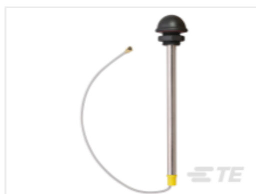
TE Part #L9000163-01 Antenna Dome 916MHz 1.32 150 UFL