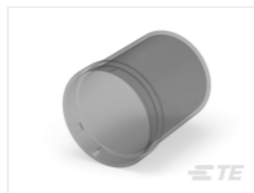
TE Part #2213748-1 COVER, LIGHT CONTROLLER, 76MM DIA, MEDIUM