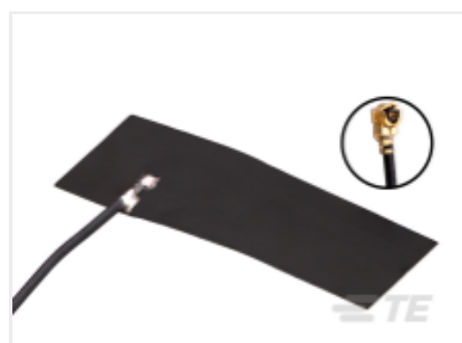
TE Part #L9000126-01 Antenna FPC Sub-6 LTE/5G 1.13 100 UFL