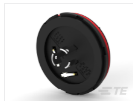
TE Part #1-2336396-1 ASSEMBLY, LIGHT CONTROLLER BASE, W/VENT