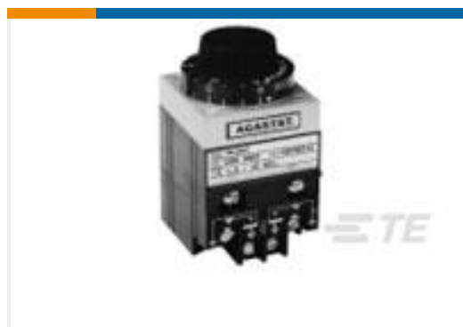
TE Part #1423157-5 7012AC=RLY,STD,ON,2P, 120VAC,15