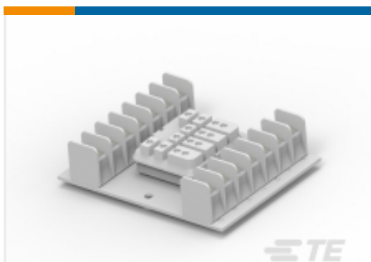
TE Part #2-1419106-2 27E867=SOCKET,KU,, ASSY,4 POLE,