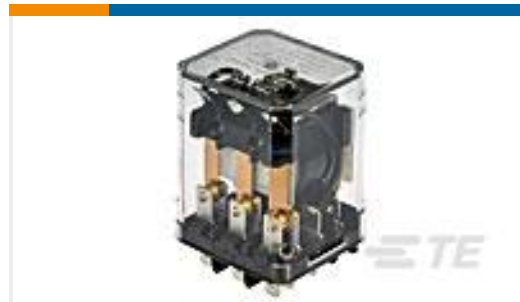
TE Part #4-1393117-5 KUP-11D15-24=KU