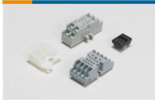
Relay Accessories, Sockets & Clips(34)