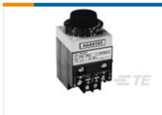
TE Part #1423157-8 7012AD=RLY,STD,ON,2P, 120VAC,50