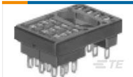
TE Part #1419111-5 24A071=CLIP,SKT,ASSY,W /SCW