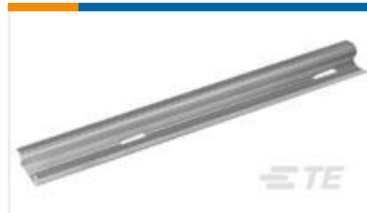
TE Part #1419111-6 24A110=TRACK, MOUNTING