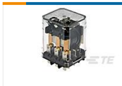
TE Part #4-1393118-2 KUP-17A19-120=KU