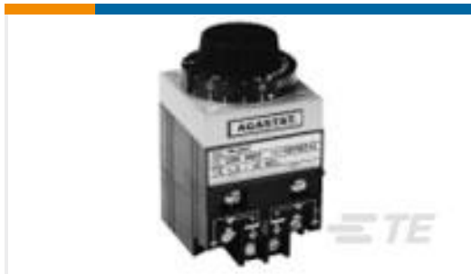
TE Part #1423162-5 7022AC=RLY,STD,OFF,2P 120VAC,1