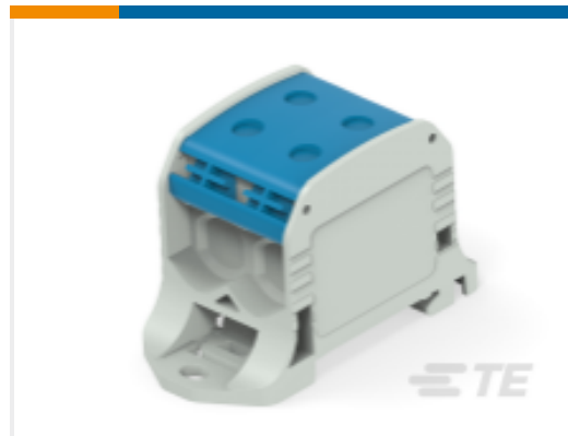
TE Part # 1SNF516121R0000 CBS50-4P...