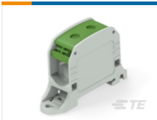
TE Part # 1SNF516031R0000 CBS50-2P...