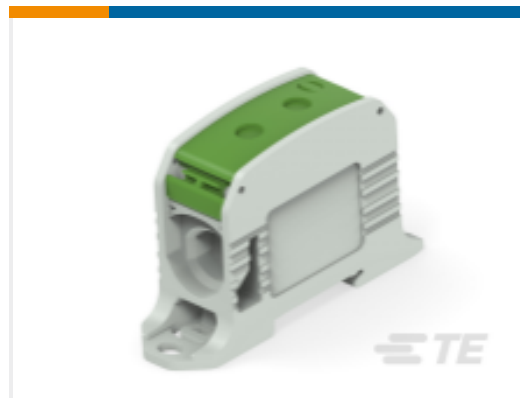
TE Part # 1SNF526031R0000 CBS95-2P...