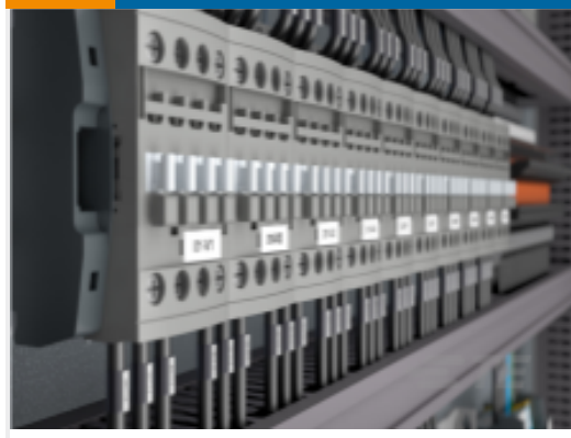
TE Part # 1SNA235776R0000 TAA0917