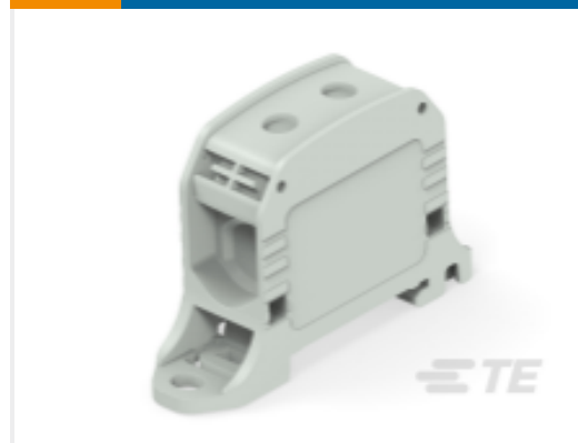
TE Part # 1SNF516011R0000 CBS50-2P...