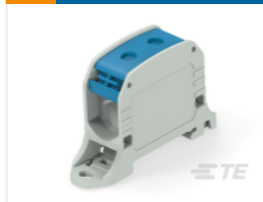
TE Part # 1SNF516021R0000 CBS50-2P...