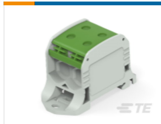
TE Part # 1SNF516131R0000 CBS50-4P...