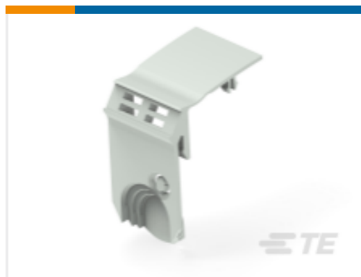
TE Part # 1SNF926710R0000 CBS95-Cover