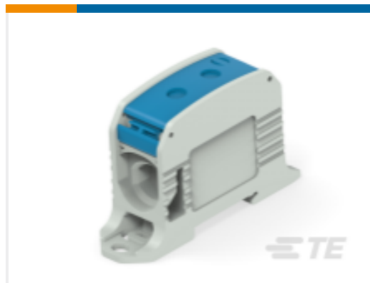
TE Part # 1SNF526021R0000 CBS95-2P...