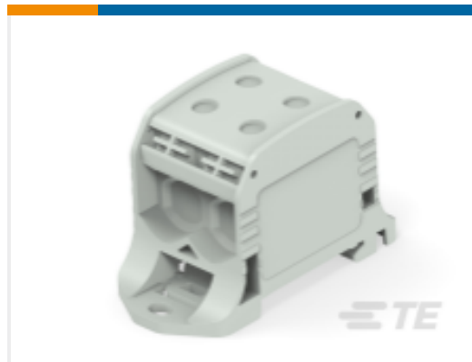
TE Part # 1SNF516111R0000 CBS50-4P...