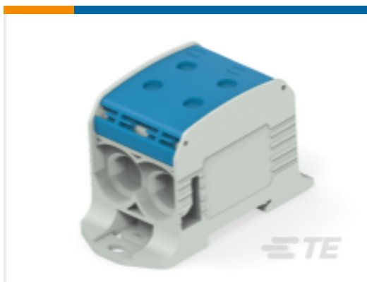
TE Part # 1SNF526121R0000 CBS95-4P...