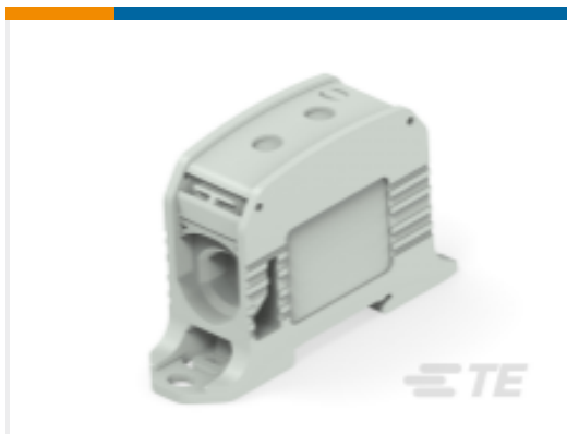
TE Part # 1SNF526011R0000 CBS95-2P...