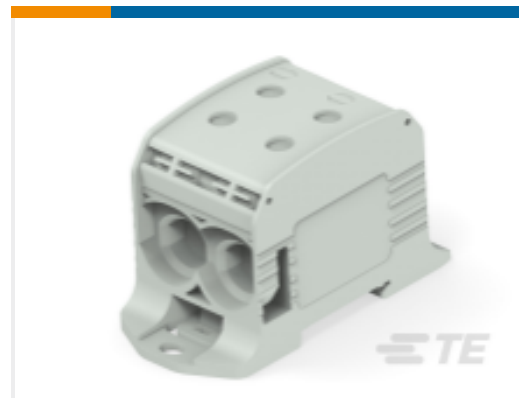
TE Part # 1SNF526111R0000 CBS95-4P...