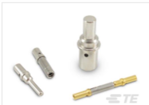
TE Part #CAT-D48-ST273 DEUTSCH Connector Solid Contacts