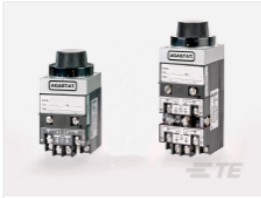
TE Part # 1-1423159-9 7012PB=RLY,STD,ON,2P,125VDC, 5