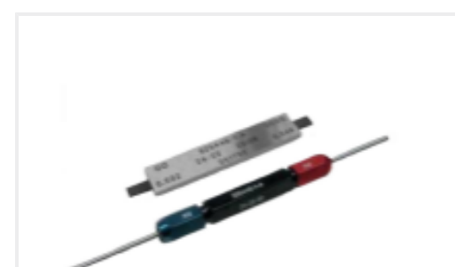
TE Part #1-525441-9 PLUG GAUGE, HANDTOOL