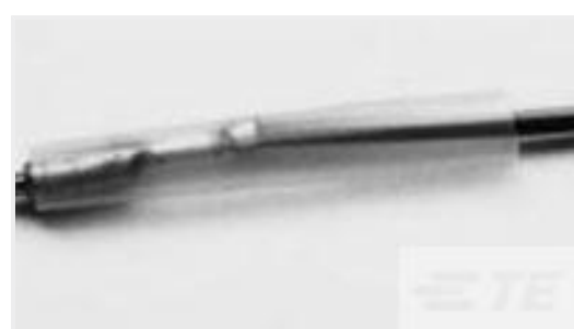
TE Part #CV25852001 RW-175-E-3/8-X-STK