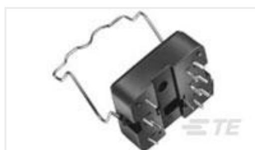
TE Part #9-1393809-1 V23154Z1002