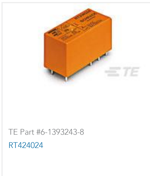
TE Part #6-1393243-8 RT424024