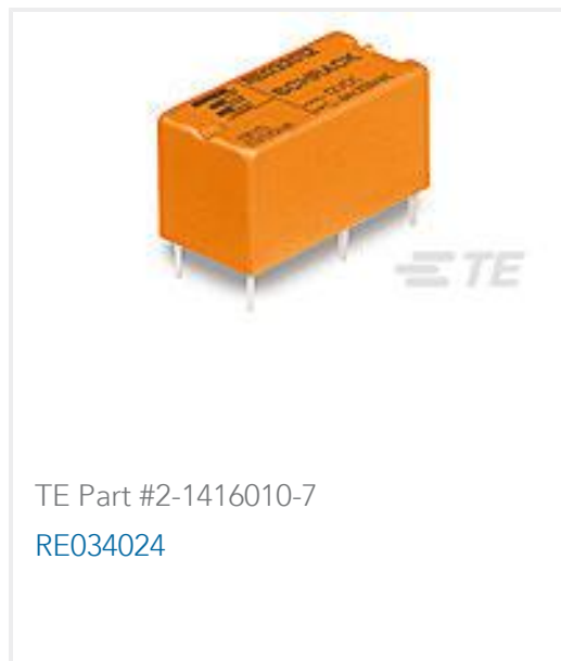
TE Part #2-1416010-7 RE034024