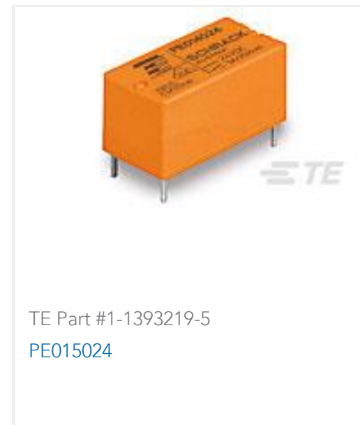
TE Part #1-1393219-5 PE015024