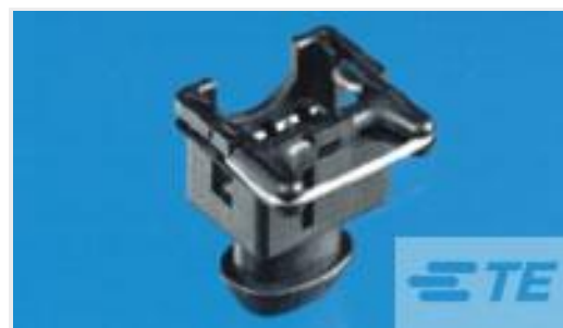
TE Part #828657-3 2P JUNIOR-TIMER GEH