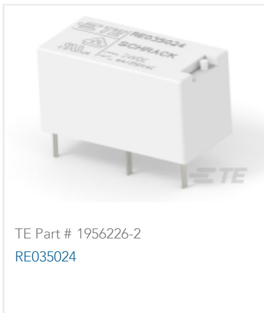
TE Part # 1956226-2 RE035024