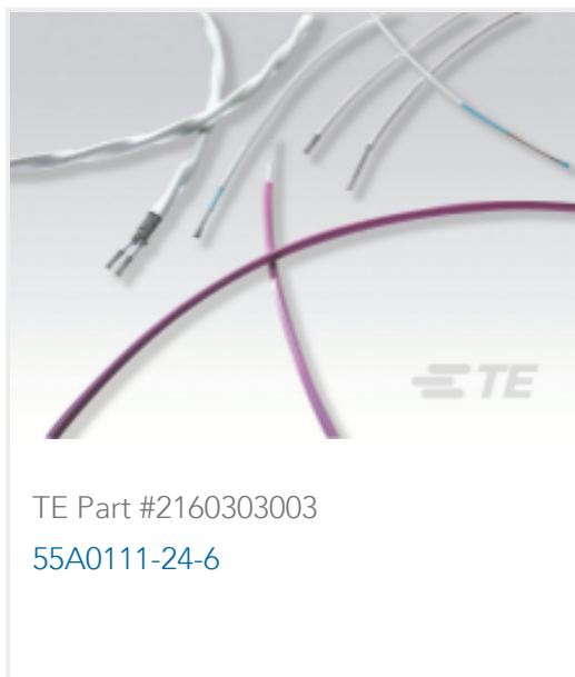
TE Part #2160303003 55A0111-24-6