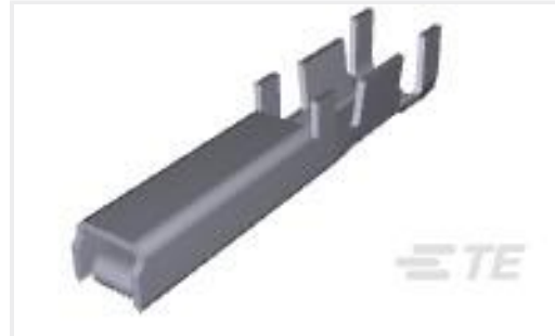
TE Part #1-917511-2 DYNAMIC D-3 REC CONT. 2L AU 0.38 L/P