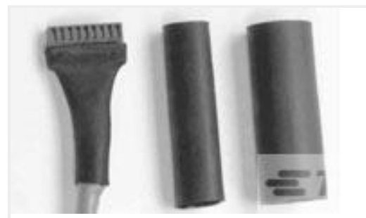
TE Part #6465212003 DWP-125-1/2-0-STK