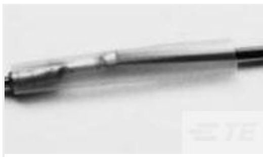
TE Part #CV3301-000 RW-175-3/32-X-STK