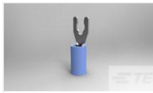
TE Part #52935 TERMINAL, PIDG SPR SPD 16-14 6