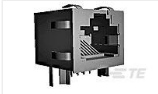
TE Part #1-406541-5 MJ, INV, 1X1, 0PNL G., 100" ST, SN