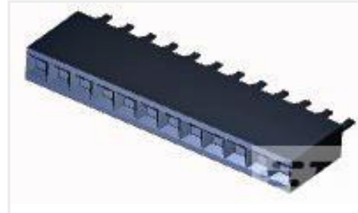
TE Part #6-534237-0 12 MODII VRT SR CE 100/115