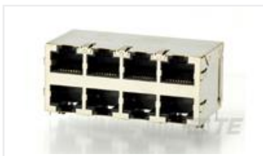
TE Part #5569257-1 STK MJ ASSY, 8POS, 2X4, SHLD, CAT5