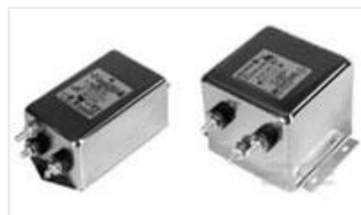
TE Part #1-6609035-3 20ESK6=F7585 S0