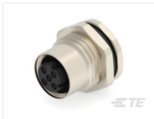
TE Part #T4131512051-000 M12, REAR MOUNT, FEMALE, D, 5P, SOLDER WIRE