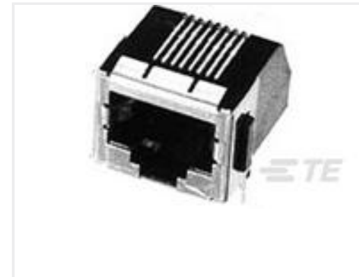
TE Part #5555153-1 MJ, LPF, R/A, 8P, PCBG, PSTP.15TTR