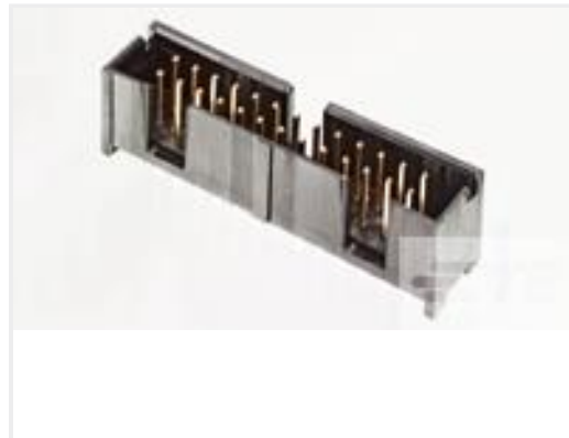
TE Part #1761681-3 IDC LOW PRO HDR 10P VERT HT BLACK