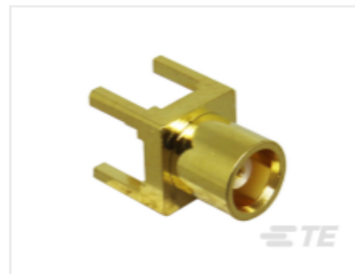
TE Part #CONMCX001 MCX Jack 50 Ohm PCB Through Hole