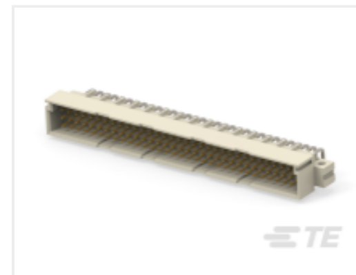
TE Part #364915-E STVC 96 M ABC VVW 4-00 0606 * * 247 E007