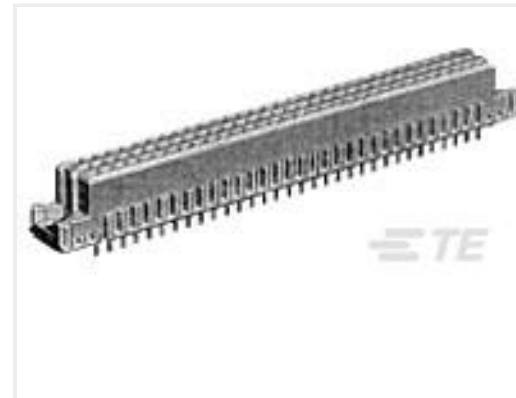
TE Part #5535090-4 ASSEMBLY, RECEPTACLE, EUROCARD, T