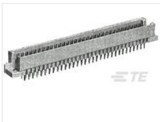
TE Part #5650470-5 ASSY, PIN, EUROCARD, TYPE R, LEAD-