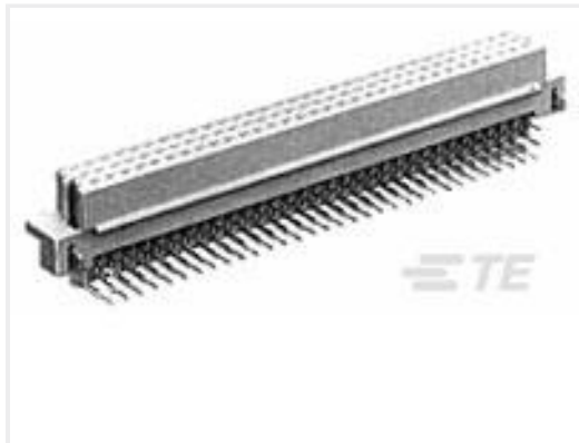
TE Part #650461-4 096 EURO TYPE R RECPT ASSY