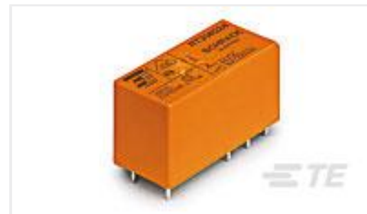
TE Part #7-1393239-8 RT314A05