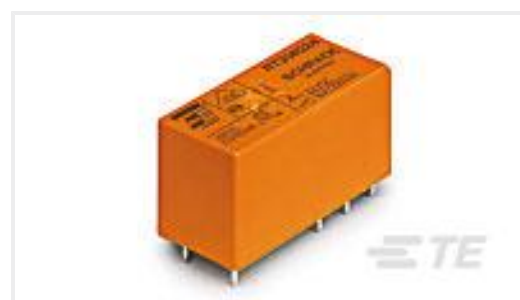
TE Part #7-1393239-2 RT31L006