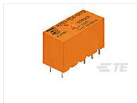
TE Part # 1-1415899-4 RZ03-1A4-D006