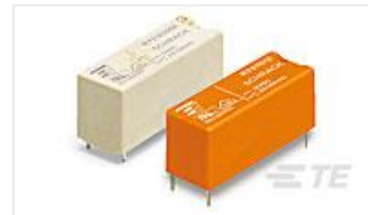
TE Part #1956164-1 RY211024R