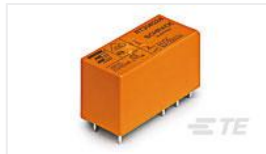
TE Part #7-1393239-3 RT31L012