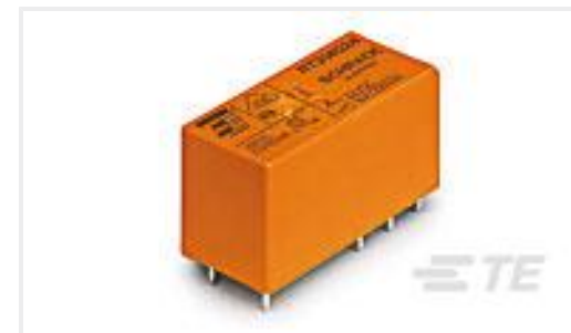
TE Part #4-1393243-4 RT424A05