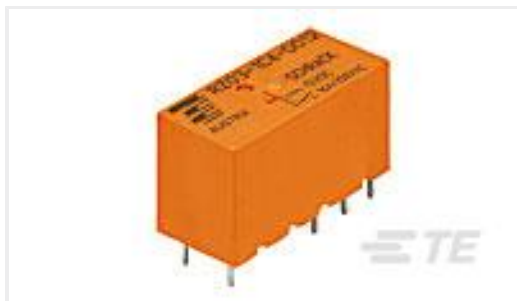
TE Part #5-1415899-5 RZ03-1C3-D024