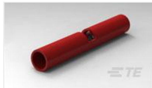
TE Part #8-320559-5 SPLC BUTT PIDG 22-16C 22-18M