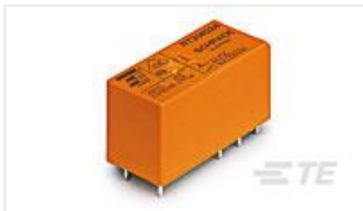
TE Part #7-1393239-5 RT31L024