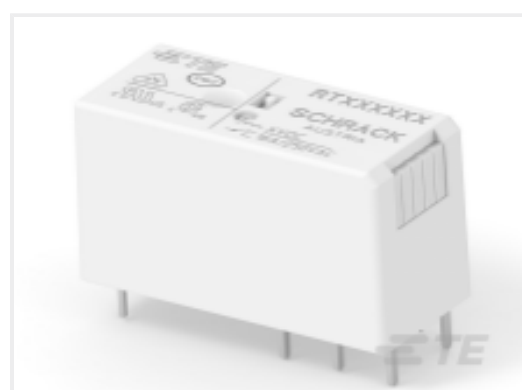
TE Part # 9-1393239-3 RT314006