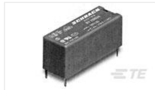
TE Part #4-1393224-9 RY211024