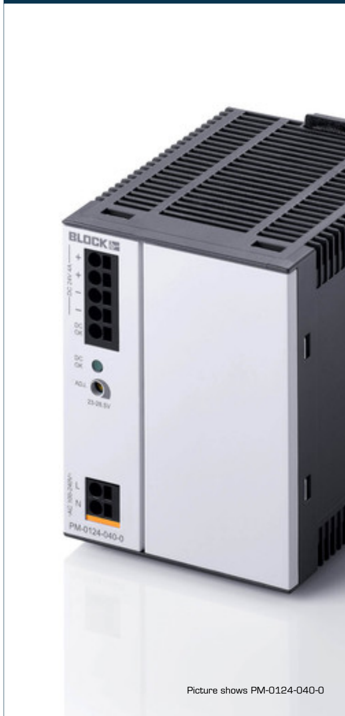
Picture shows PM-0124-040-0