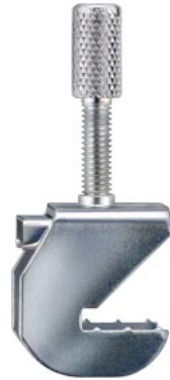
Shield terminal, for direct shield attachment on conductive mounting plates, diameter 3-8 mm