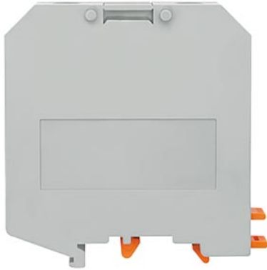
Terminal, screw terminal, through-type terminal, 50 mm 2 , gray