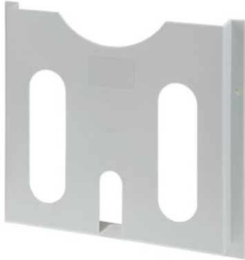
Circuit diagram pocket, 30 mm deep for DIN A4 upright, self-adhesive