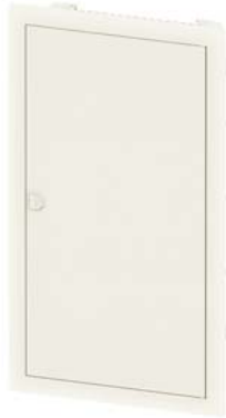
SIMBOX XL flush-mounting, 3-tier 3x 12 MW (14 MW) Safety class 2