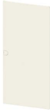
SIMBOX hood-type distribution board Plastic door white 4-tier