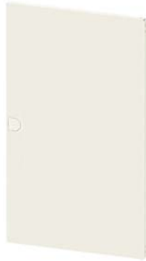
Sheet steel door for surface mounting 3-tier