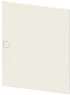
SIMBOX hood-type distribution board Plastic door white 2-tier