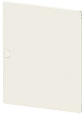
Sheet steel door for surface mounting 2-tier