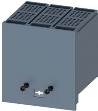
terminal cover extended 3-pole; 1 unit accessory for: 3VA10/11