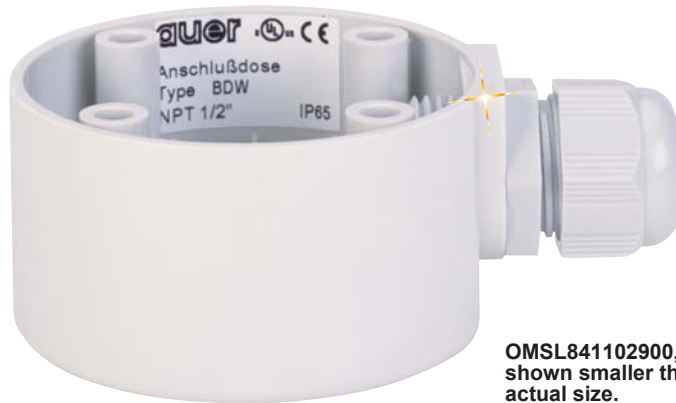
OMSL841102900, shown smaller than actual size.