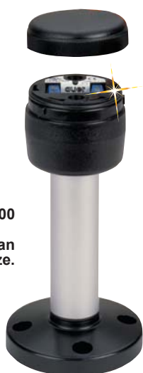
OMSL790552900 zinc foot, shown smaller than actual size.