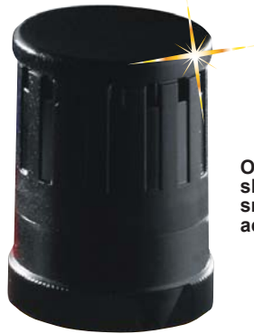
OMSL781500310, shown smaller than actual size.