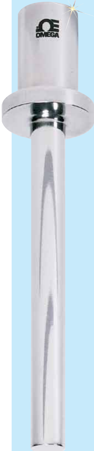
Shown smaller than actual size.

When desired, a carbon steel lap joint flange can be supplied with these wells. When ordering, specify flange pressure.