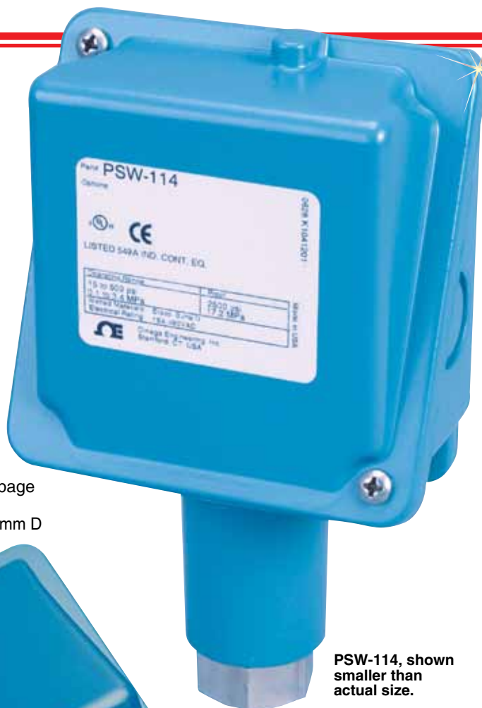
PSW-114, shown smaller than actual size.

Dimensions: 191 max H x 101 W x 60 mm D (7.5 x 4 x 2.3")