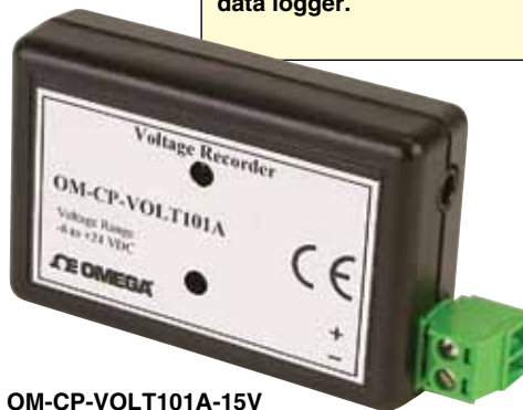
OM-CP-VOLT101A-15V data logger, shown actual size.