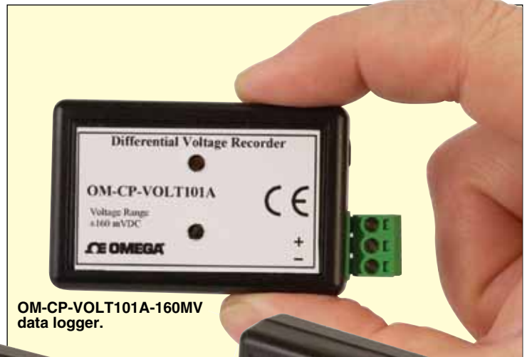
OM-CP-VOLT101A-160MV data logger.

The OM-CP-VOLT101A is available in four different input ranges: 160 mV, 2.5V, 15V and 30V versions.