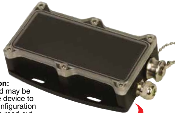
OM-CP-WATERBOX101A, optional weatherproof enclosure for data logger, shown smaller than actual size.