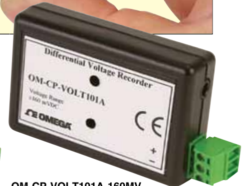
OM-CP-VOLT101A-160MV data logger, shown actual size.

Data retrieval is simple. Plug the device into an available COM port and our easy-to-use software does the rest. The software converts a PC into a real-time strip chart recorder. Data can be printed in graphical and tabular format or exported to a text or Microsoft Excel file.