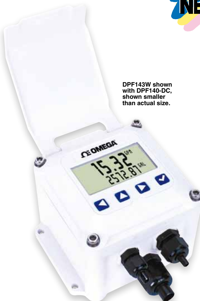
DPF143W shown with DPF140-DC, shown smaller than actual size.

The DPF140 Series meters are available in wall or panel mount configurations. Wall mounted versions can be converted from wall to meter mount with an adaptor plate. Check with OMEGA for compatible meters. Order the DPF144 only if a 4 to 20 mA output signal is a requirement, otherwise the DPF143 offers the most flexibility.