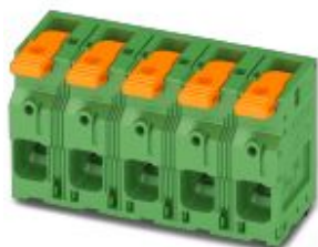
The figure shows a 5-position version

Please be informed that the data shown in this PDF Document is generated from our Online Catalog. Please find the complete data in the user's documentation. Our General Terms of Use for Downloads are valid ( http://phoenixcontact.com/download )