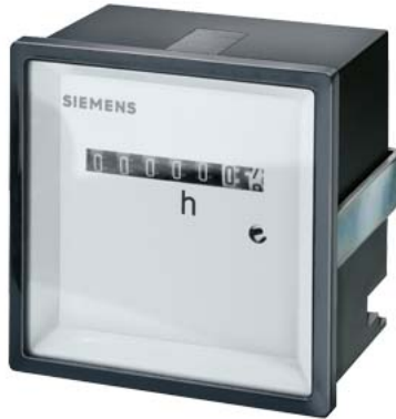
time counter 72 x 72 mm 230 V AC 60 Hz without terminal cover