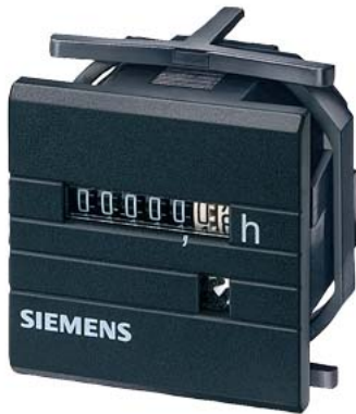
time counter 48x 48 mm 115V 60Hz AC without masking frame 55x 55 mm