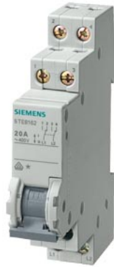
Two-way switch 20 A 2 CO