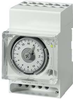
Synchronous time switch Day 1 change-over contact 230V/50Hz 3 MW