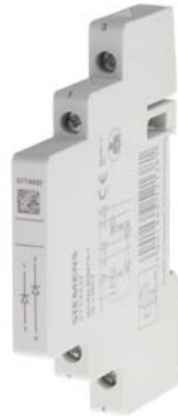
auxiliary switch, group half module