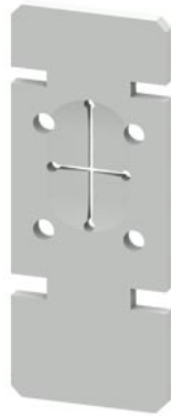
IP20 terminal cover for 5SJ4...-HG41/42