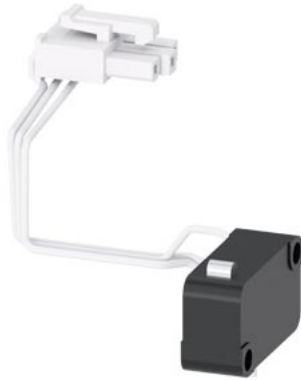
spring charge signaling switch S21 standard contact 400 V AC accessories for circuit breakers 3WL10 / 3VA27 (SE)