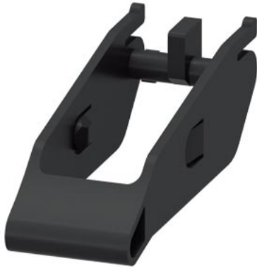
Fixing/reject bracket for plug-in relay RT series