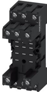
plug-in socket for PT relay, 3 changeover contacts, screw terminal