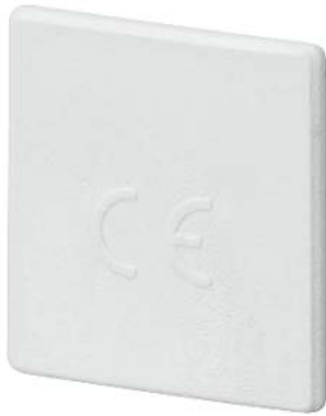
End cap 2 and 3-phase for pin busbars according to UL 508