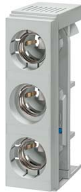
DIAZED bar mounting bases SR60 3P, DII, 25A, 500V for 5/10 mm busbars Adapter screw design