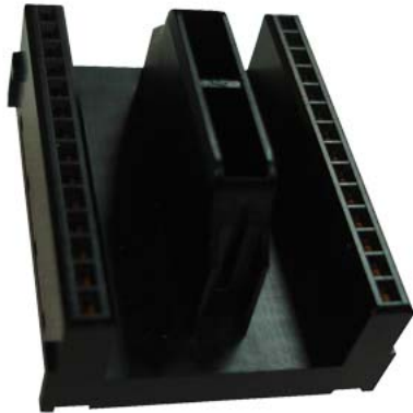
***spare part*** SIMATIC S7, bus connector (spare part)