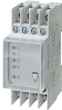
Fault signaling relay T5570 230 V AC 5 A with reset with transparent cap