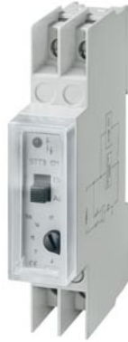
Network coupler T55 230 V AC 50 Hz With transparent cap