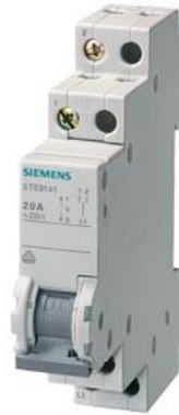
Group switch 20 A 2 groups