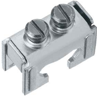
Terminal 1-pole, for bar 12x 5 Conductor connection 1x 16-35 mm 2