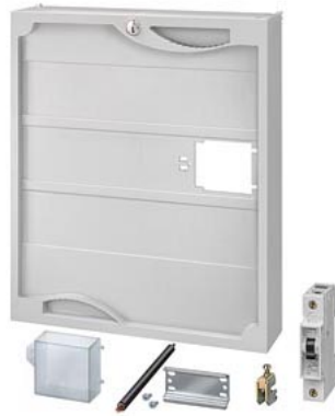
ALPHA-ZS, Tariff switching device retrofit kit with miniature circuit breaker B10A with cover for UAR 300 mm with busbar system