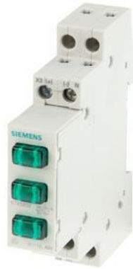
Phase signaling device 3 lamps 230 V 3x green