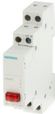
Indicator light 1 lamp 230 V red