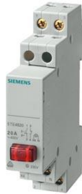
button, 2 NC 20 A 1 key red, Lamp 230 V